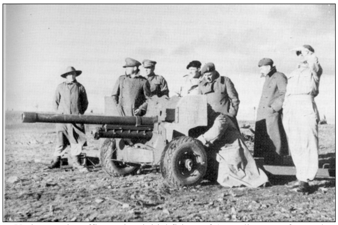
Various senior officers view initial firings of Australian manufactured 6 pdr

During the period of manufacturing and proofing the guns, a number of local modifications were made to the original design to improve performance and accuracy. As the prime contractor GMH received the various components manufactured by other contractors around Australia and the final assembly of the gun and carriage was undertaken at the GMH Beverley Plant in South Australia.