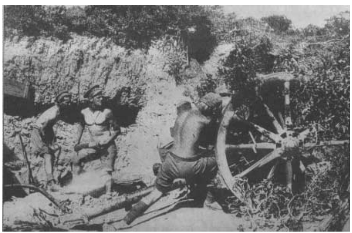
Australian Gunners in action - 1915 -