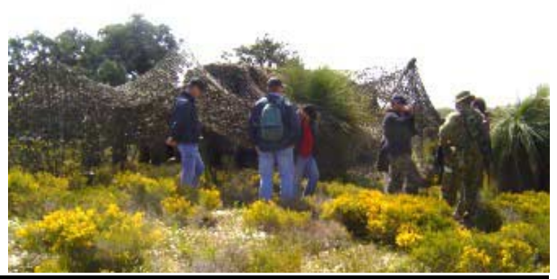
3<sup>rd</sup> Fd Regt Members enjoying the comforts of Lancelin