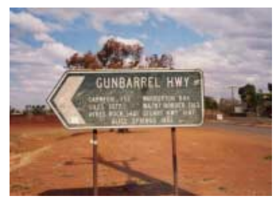
Figure 1 Sign at Wiluna to the Gunbarrel (there weren't many options)

The route from Perth to the Alice totalled 4108km, of which almost 2500km was dirt, mud and/or the deepest corrugations seen by modern homo sapiens. Those from the eastern states of course, travelled significantly further to join us in Perth for the start. So the convoy averaged around 205 kms per day.