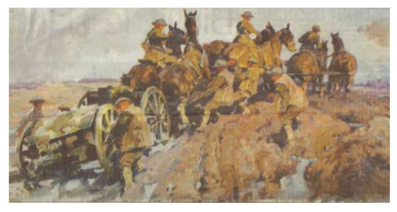
Horses pulling an 18-pound gun, by H. Septimus Power (1919)

- The West Australian Tuesday Apr 21, 2005 -