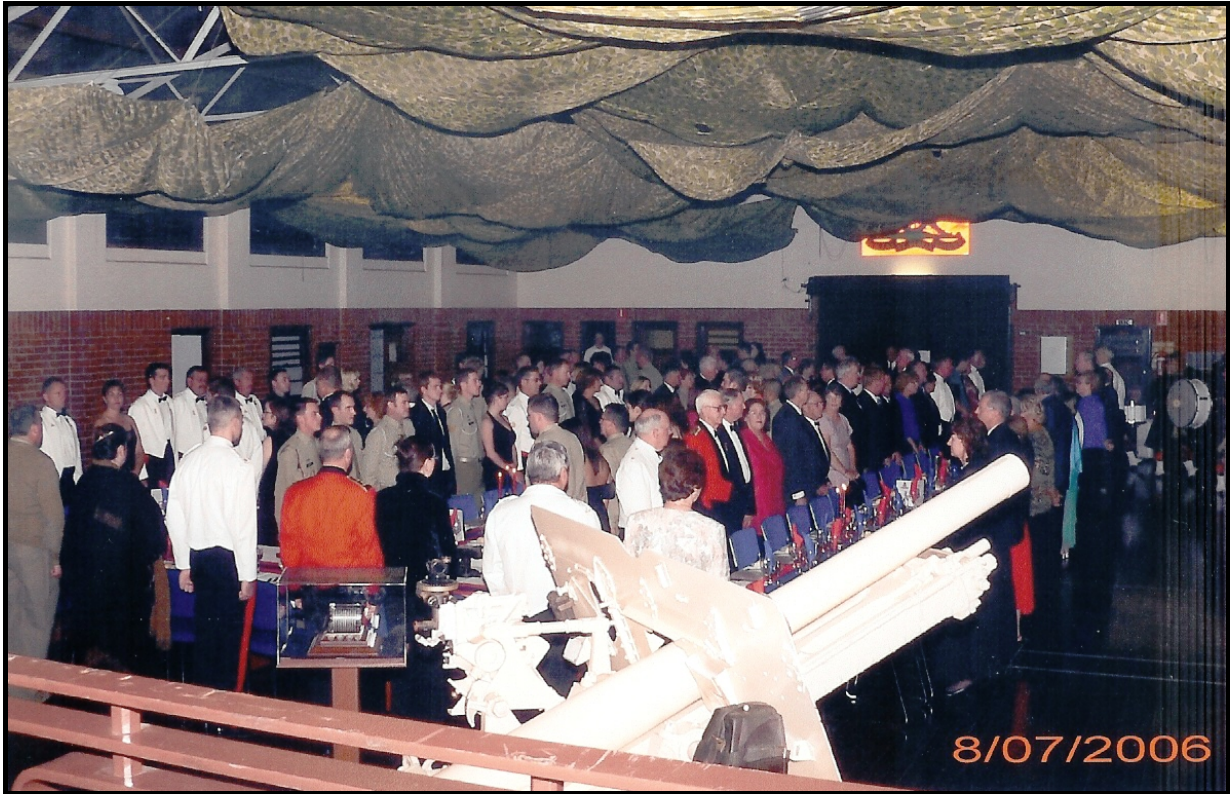
SIR!! The Mess is assembled – Corp Dinner July 2006

Our Thanks to All Seasons catering for the excellent service provided at the Battery Dinner