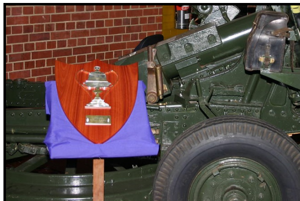
Mt. Schanck Shield