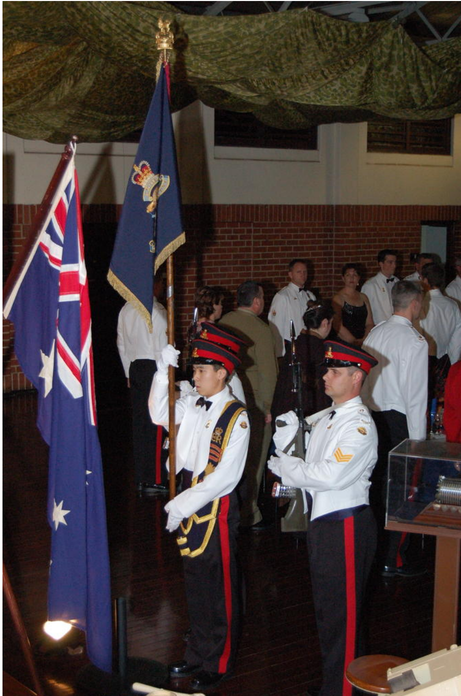
The Regimental Banner is marched in at the start of the Battery Birthday Dinner in July 06