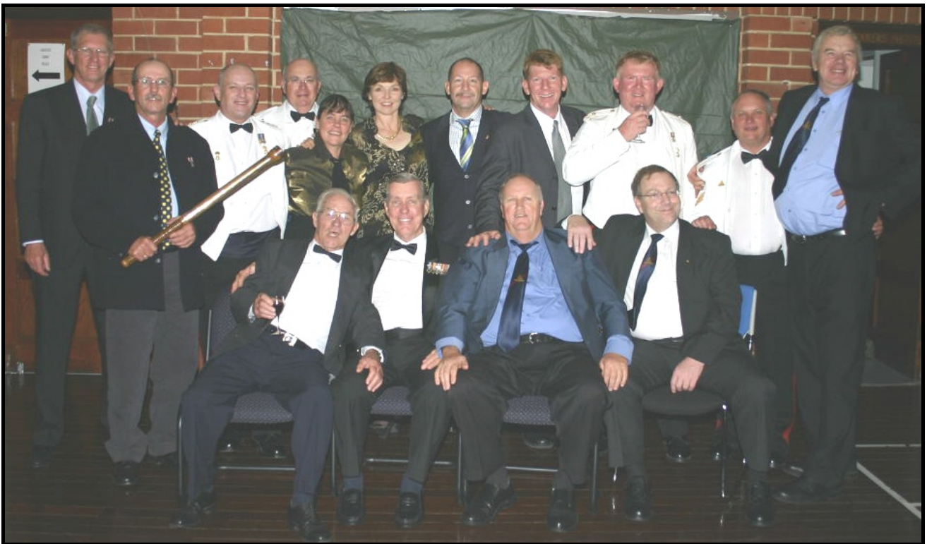
Members of the 1978 Mt. Schanck 7 Fd Battery winning team

THEIR BLOOD RUNS RED---- SO WEAR RED! --- Lest we Forget, Lest we Forget.