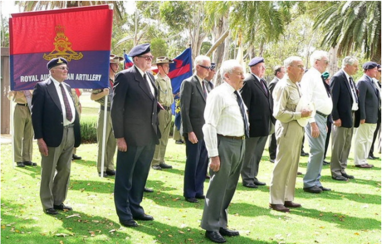
Gunners at attention during the Wreath lying ceremony