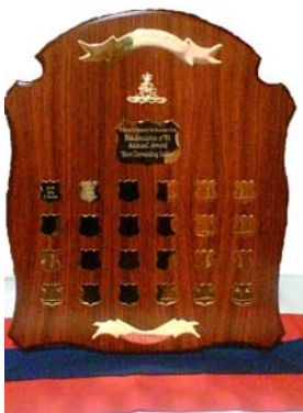
Close up shots of the Board