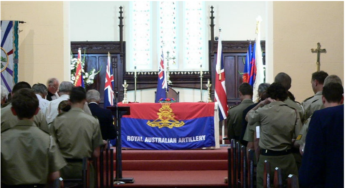
The RAA Association banner draped over the altar at St. Matthews