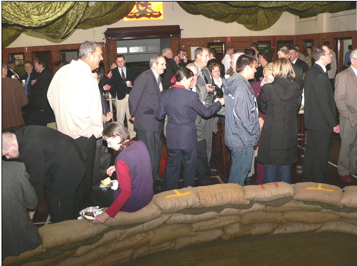
Anzac Day – Fellowship -