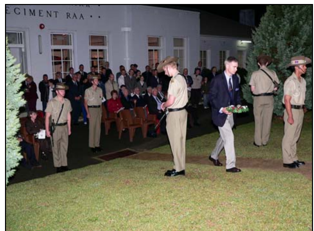
BC 7 Bty 3 Fd Regt RAA laying a wreath at the Dawn Service