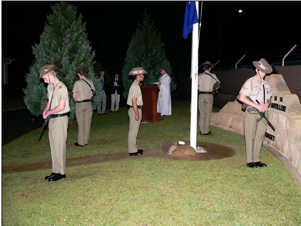
Dawn Service at the Memorial Wall – Hobbs Artillery Park –