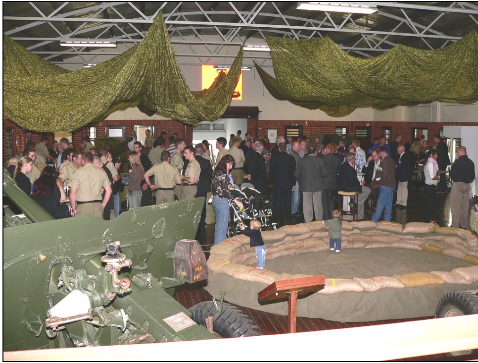
Nothing like starting young in the 'Two Up' ring

When an old person dies a library burns to the ground. (African proverb)