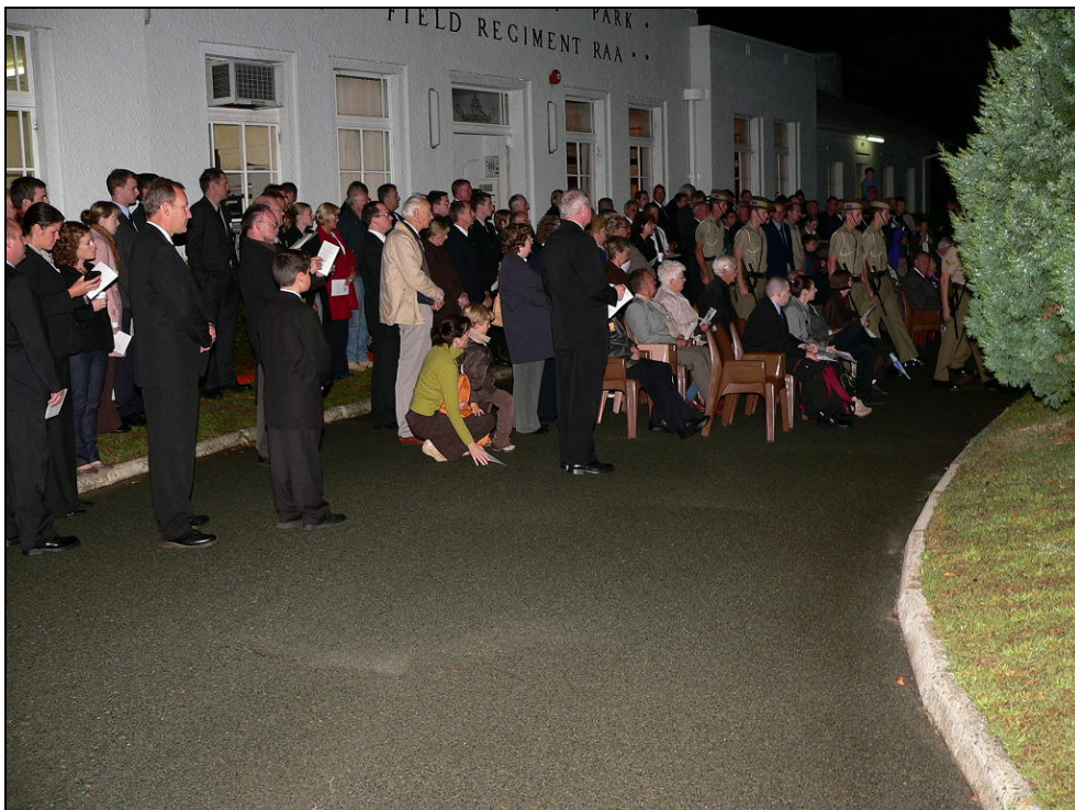
Some of the early morning crowd that attended the Dawn Service at HAP