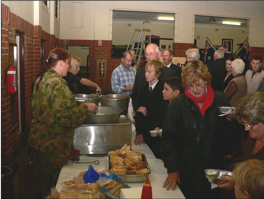
Anzac Day – Gunfire Breakfast -