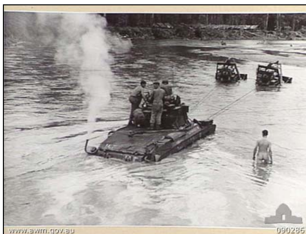
BOUGAINVILLE. 1945-03-30. TWO BULLDOZERS TOWING A B SQUADRON, 2/ARMoured REGIMENT MATILDA TANK THROUGH THE PURIATA RIVER AFTER IT HAD BECOME BOGGED IN THE SOFT SAND BOTTOM.

Throughout this battle the Japanese used their artillery on the Australian positions but it was mainly inaccurate and showed that they lacked trained observers to register fall of shot and to adjust their barrages on to targets. The Japanese had no lack of artillery both field and medium calibre guns but did not appear to understand the basic principles of the use of artillery as an offensive weapon to spearhead an attack.