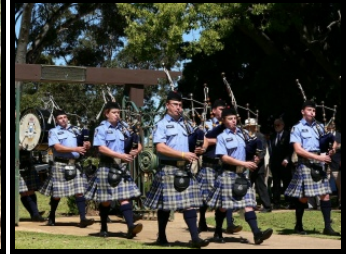
The WA Police Pipe Band