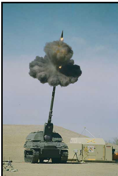
Taken at the right moment