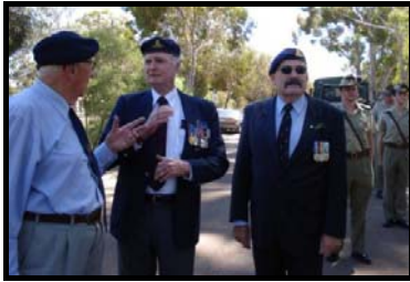
The tie is slightly of center RSM...