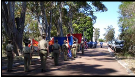
The Banner party about to step off