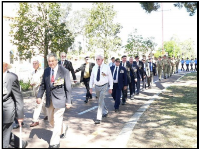
Old Gunners stepping out on Gunners Day 2007