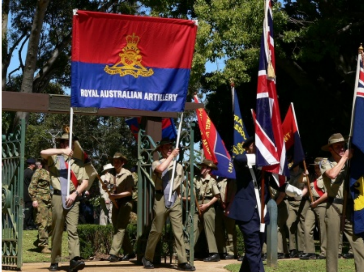
The RAA Association Banner passes through the Memorial Gates