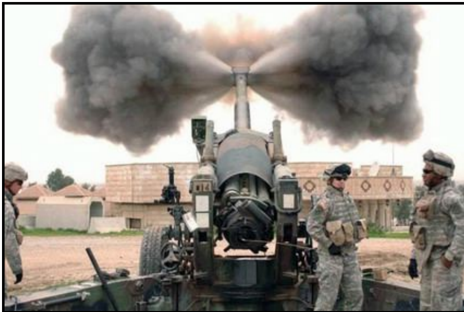
Is that what you call a M198 BOWTIE??