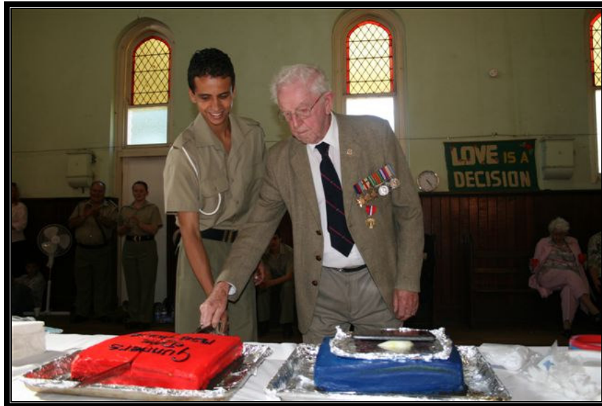
80 th GUNNER'S DAY 2008