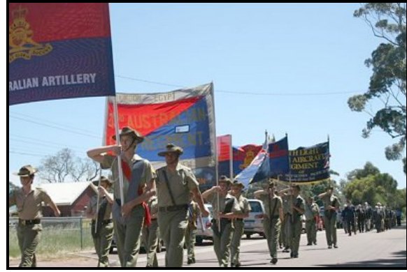
Gunner's Day Parade