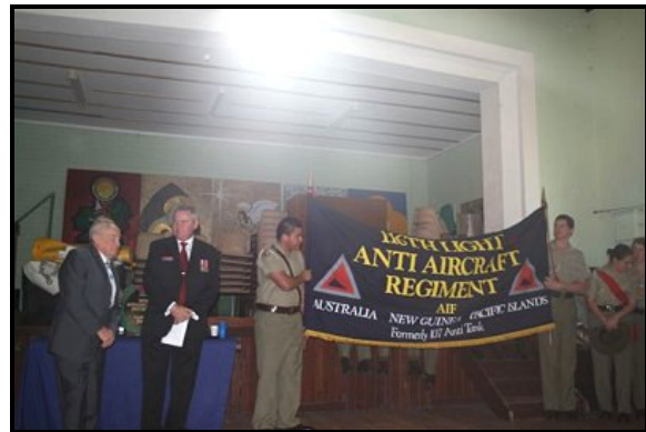
Parading of 116 Light Anti-Aircraft Regiment Association Banner in the Church and then presentation to RAA