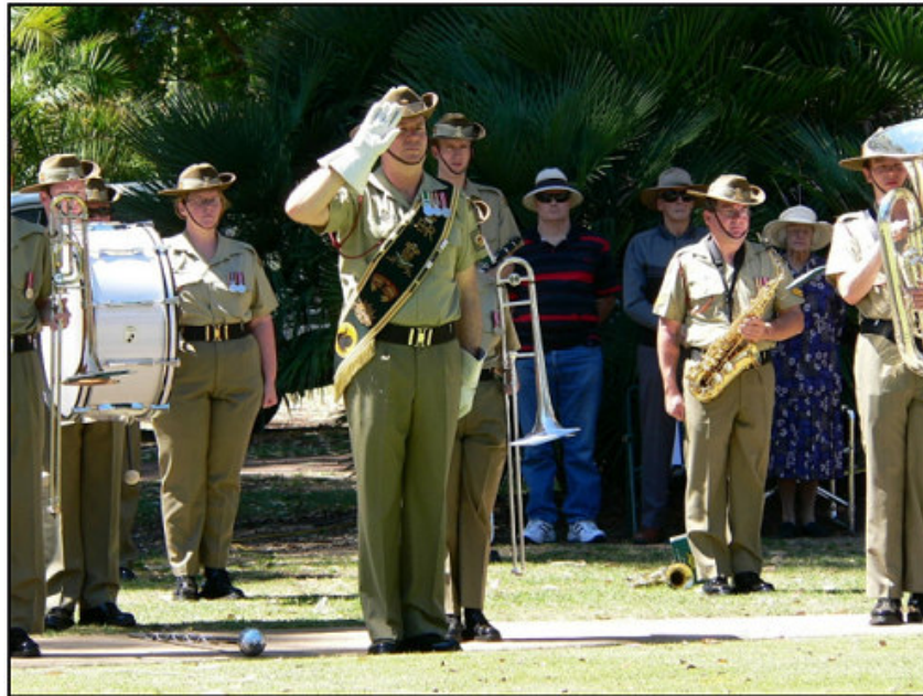
Australian Army Band - Perth at Gunners Day 2008

40 guests attended the second Dining-In night for serving and former serving members with three stripes, a crown or galloping horses with the Battery. All share a love and a respect of Artillery and a terrific evening was made possible by support from the AAB-P, catering and Battery staff.