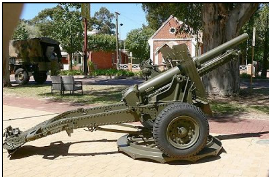
Newly restored 25pr Gun Howitzers at the Guildford War Memorial, Stirling Square adjacent to Saint Matthews Church