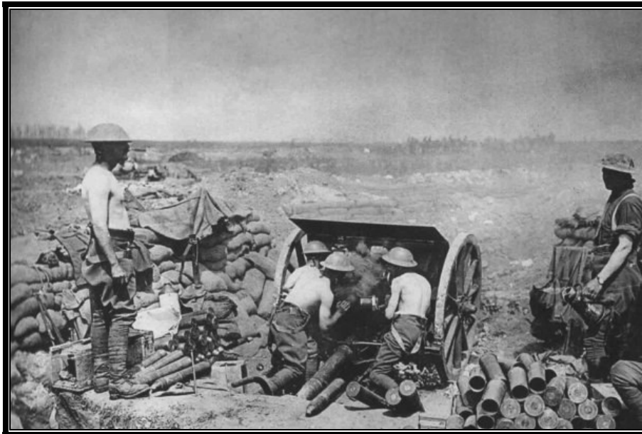
18 Pounder providing fire support to Australian attacks at Pozieres, July 1916