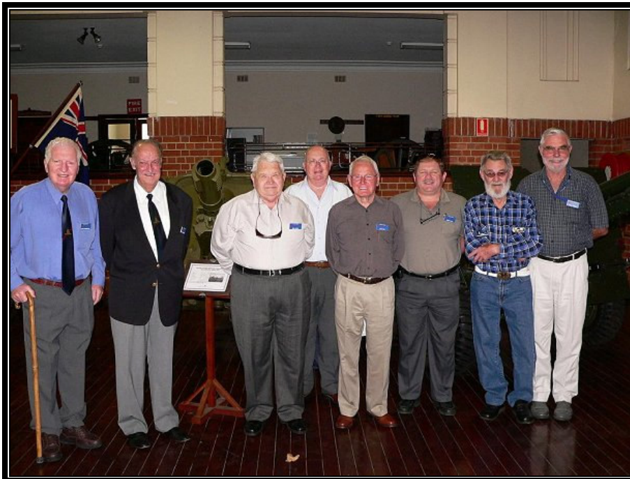
20 th Birthday - Foundation Members of RAAHS