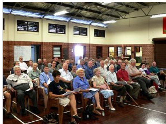
Members in attendance at the AGM Hobbs Artillery Park on Sunday 8 th March