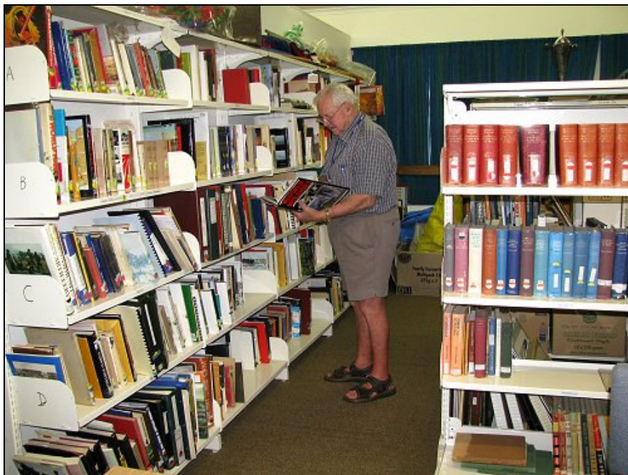
Part of the extensive RAAHS Library