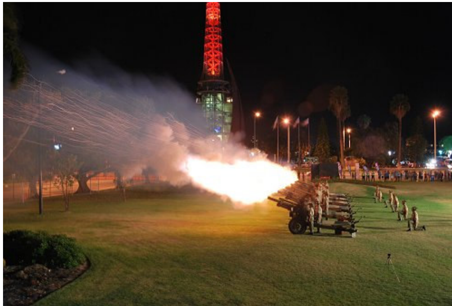
7 Fd Bty RAA firing during the 1812 Overture December 2009 - The Esplanade, Perth