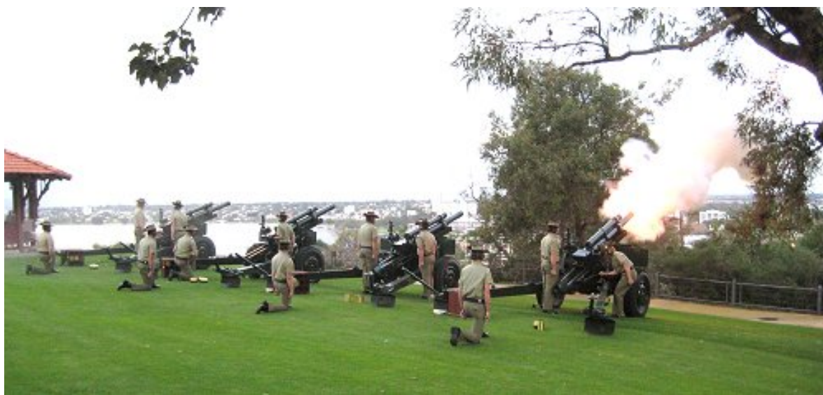
19 GUN SALUTE for the new Governor OF WESTERN AUSTRALIA