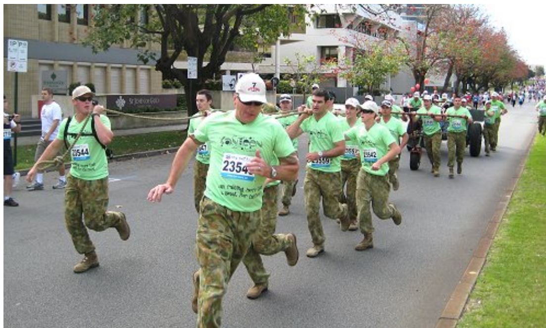
7 Fd Bty participated in the City To Surf Fun Run