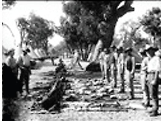
(Above Boer War troops formed up for a pre-embarkation kit inspection at Karrakatta Camp).

Contrary to barrack scuttlebutt, Irwin Barracks is not named after Erwin Rommel. In fact, the barracks were named ' Irwin Training Centre ' on 9 Nov 1948 to perpetuate the memory of COL F C Irwin, the first military commandant of Western Australia (1829-1833). Prior to this naming, the area was known as ' Karrakatta Camp ' and was first set-aside as a military training area by the WA Colonial Government in 1895. It was used for short camps (2-9 days) and courses for Militia & School Cadet units until the beginning of WWII. In April 1897, over 600 volunteers (including cadets) from Perth, Fremantle, Geraldton and Bunbury held an Easter Camp living in tented accommodation with water supplied from service tanks and filtered water bags for washing purposes. A rifle range was constructed and equipped in 1896 with seven sets of Jeffries patented 'Wimbledon' targets – only the fourth range in the world so equipped. This range replaced the original located at Mt Eliza and was used by all metro-based troops including the WA Contingents which trained at Karrakatta camp for the South African (Boer) War (1899-1902).