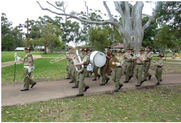
Band lead off ...to...