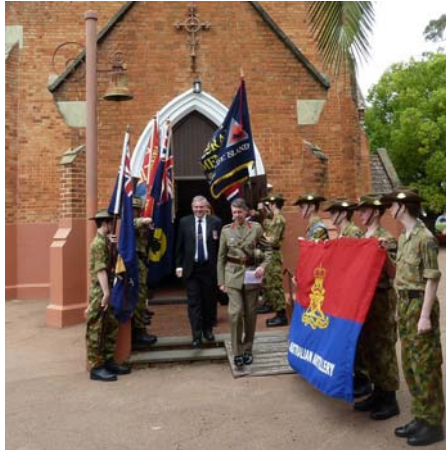
Out of the church and onto ....