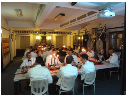
The old Mess was ablaze with life

There was an even spread of serving and retired officers and judging by the noise level (conversations), a good time was had by all.