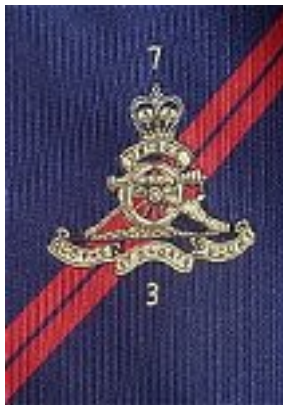
DETAILS ON TIE