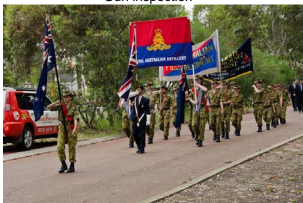
Cadets carrying flags leading the parade