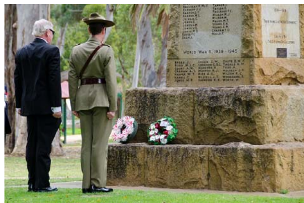
Laying of wreaths