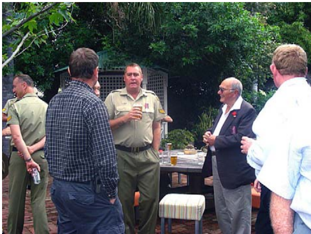
Socialising after at the Rose & Crown