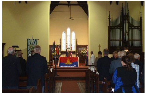
Service in St Matthews Church