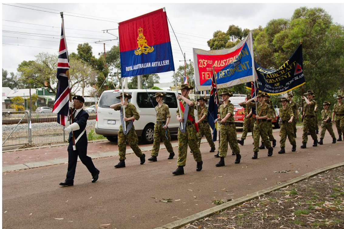
Gunners Day 2011