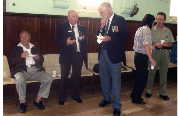
Afternoon Tea in the hall