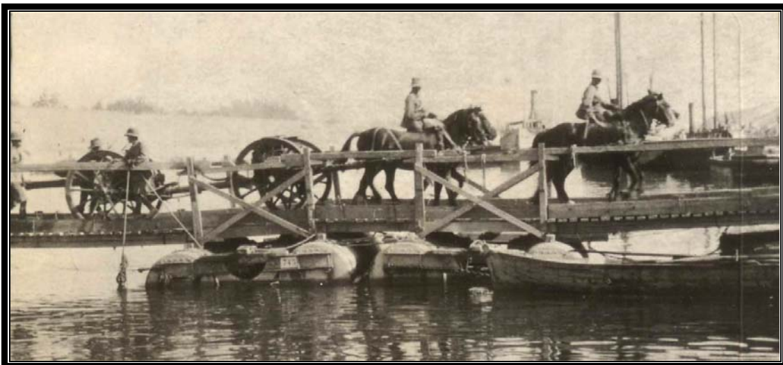
Australian 18 Pounder crossing the pontoon bridge, Suez Canal, Sarapeum, Egypt, April 1916