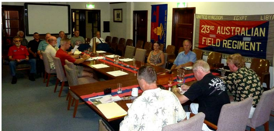
RAAA of WA AGM 13 March 2012