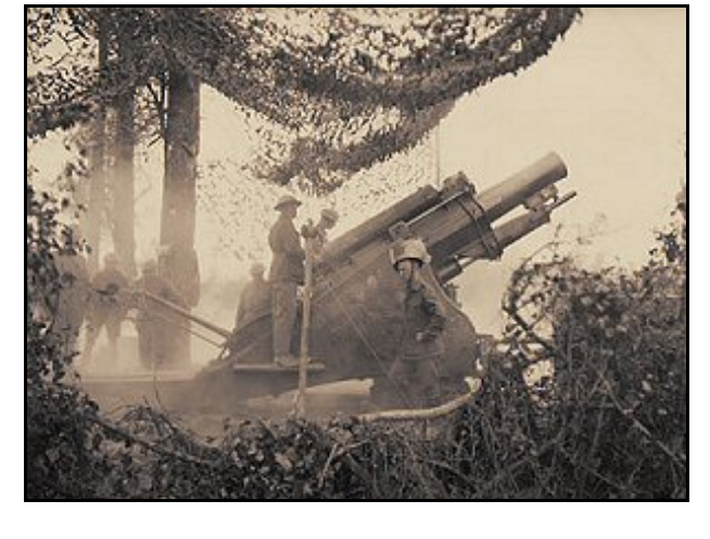
8 inch howitzers - 54th (Aust) Siege Battery