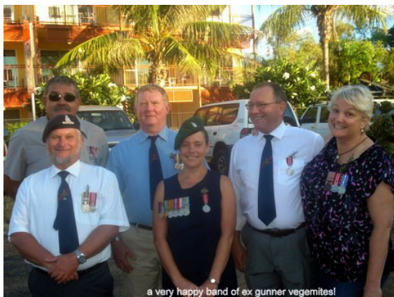
A very happy band of ex-gunner vegemites !