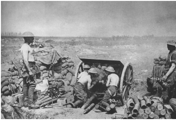
WESTERN FRONT - WW1