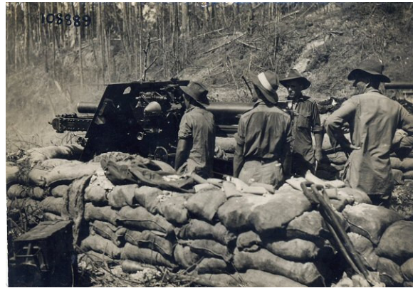
BORNEO - WW2