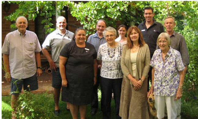
Guildford Centenary 2013 Committee

Updates will be provided in each ARTYWA.