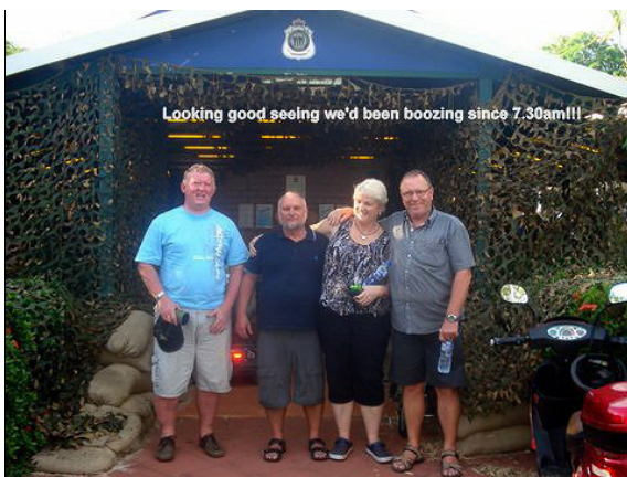
Looking good seeing we'd been boozing since 7:30 am!