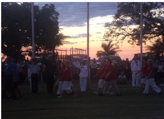
Dawn Service March Past