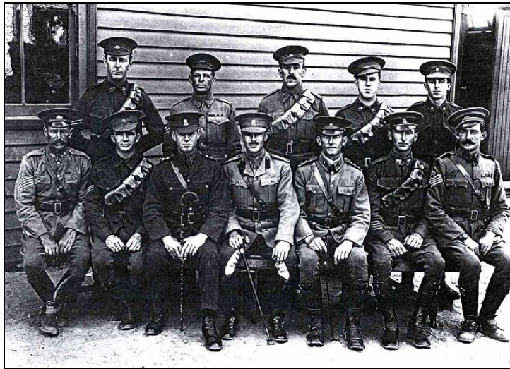
OFFICERS & NCO'S 1917