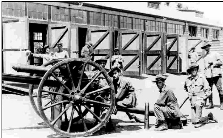
18 POUNDER, GUILDFORD REMOUNT DEPOT PRE-1918