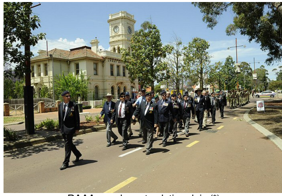
RAAA march past saluting dais (*)