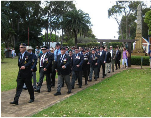
RAAA members marching to the church service