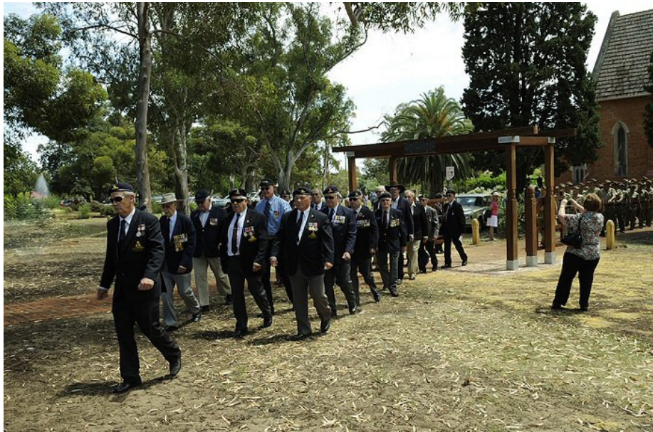
RAAA MEMBERS MARCH THROUGH THE TALBOT HOBBS MEMORIAL GATES