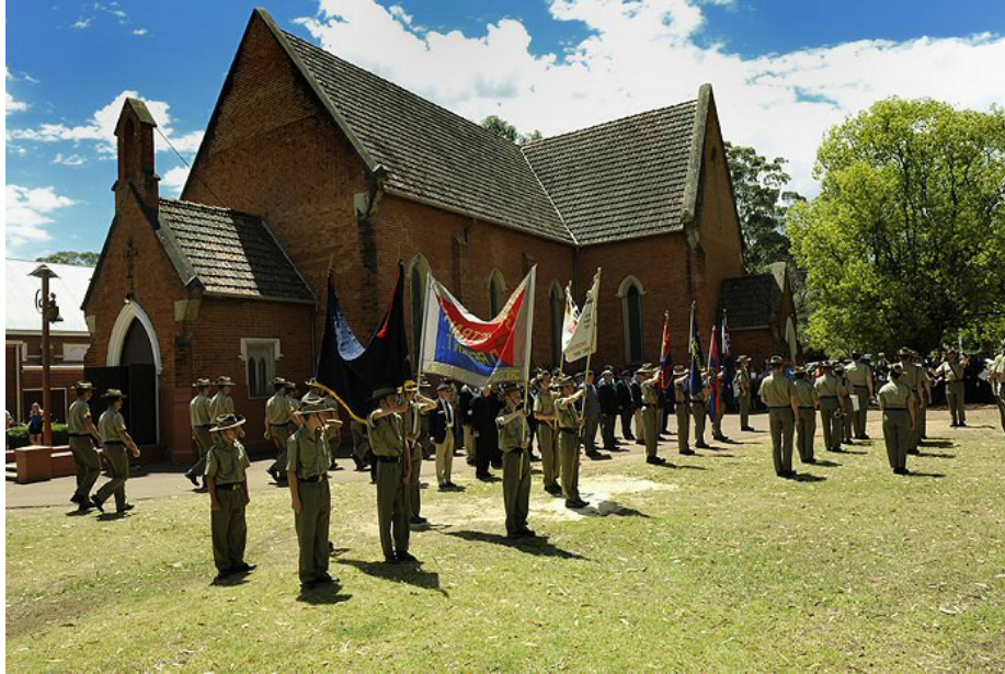
COLOUR PARTY IN BESIDE ST MATTHEW'S GARRISON CHURCH