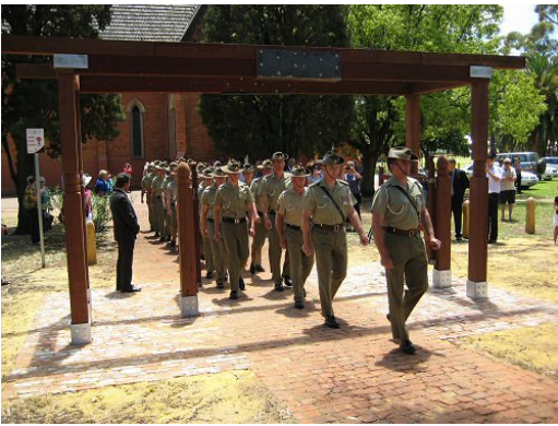
3 Light Battery