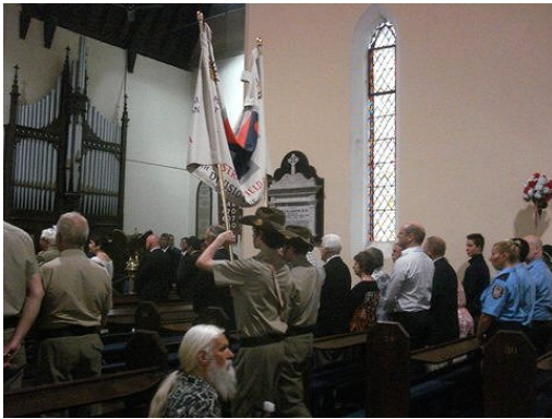
Colour Party entering St Matthews Church