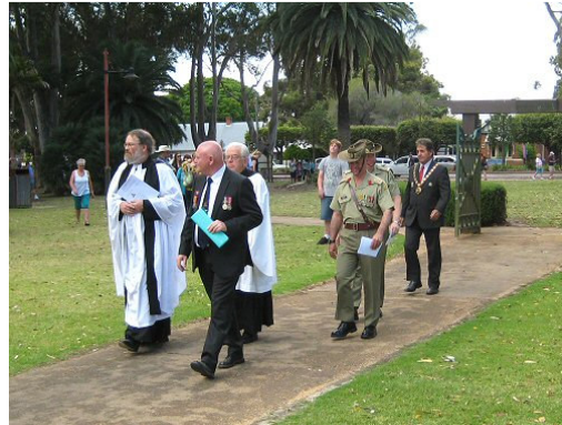
Clergy and dignitaries proceeding to the service