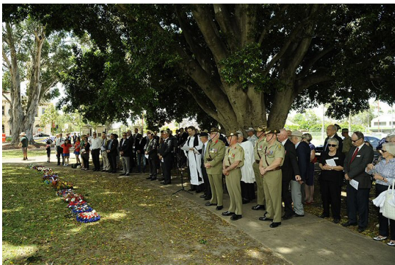
Service at War Memorial (*)