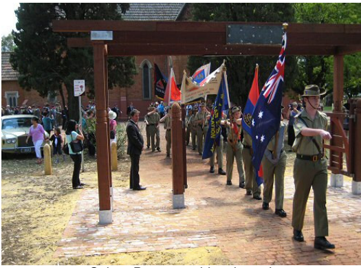
Colour Party marching through Talbot Hobbs Memorial Gates