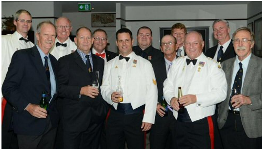
Senior NCO's of 7 FD BTY RAA