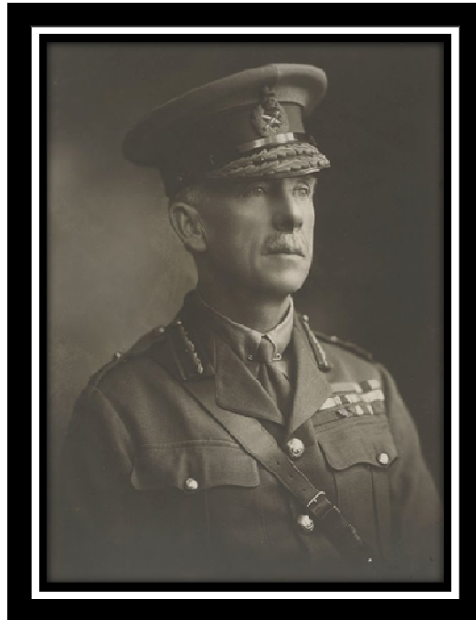
Centenary of Artillery in Guildford 85th Gunner's Day