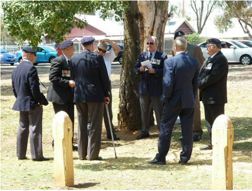
Gathering of comrades