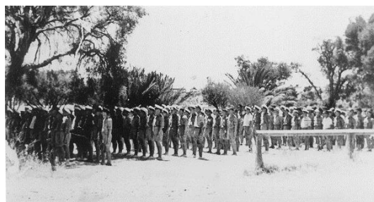
NAP Training – Garden Island 1941

Legend has it that despite all this weaponry there was no ammunition issued and the depth charges were not fused. "Well! You didn't want to hurt anybody and besides we didn't want to alarm the civilian populace with loud noises". Actually it was proved during the Japanese Mini Submarine attack on Sydney Harbour that boats of this nature were just as likely to blow themselves up if they dropped a depth charge because they did not have the speed to clear the area before the explosion.