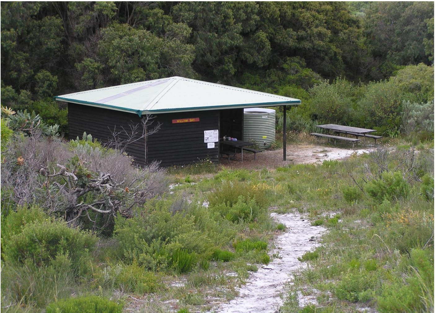
Photo of the William Bay campsite