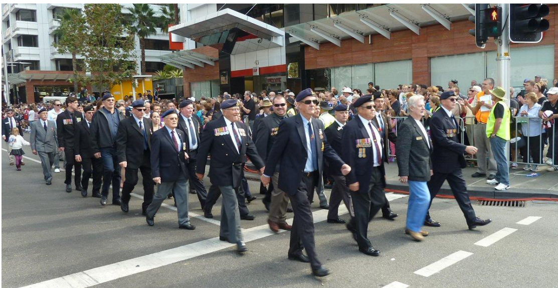
ST GEORGES TERRACE PERTH