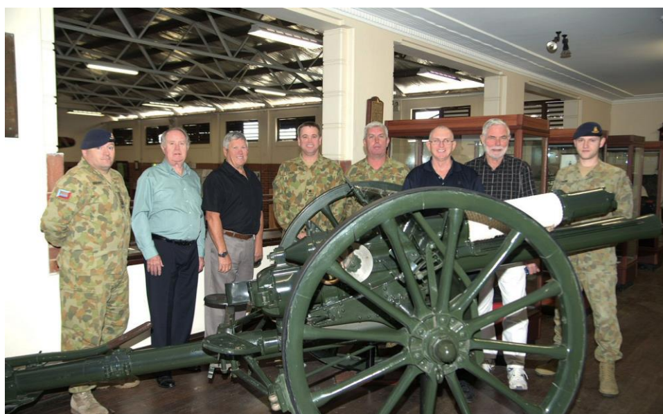
OUR ANZAC CONNECTION