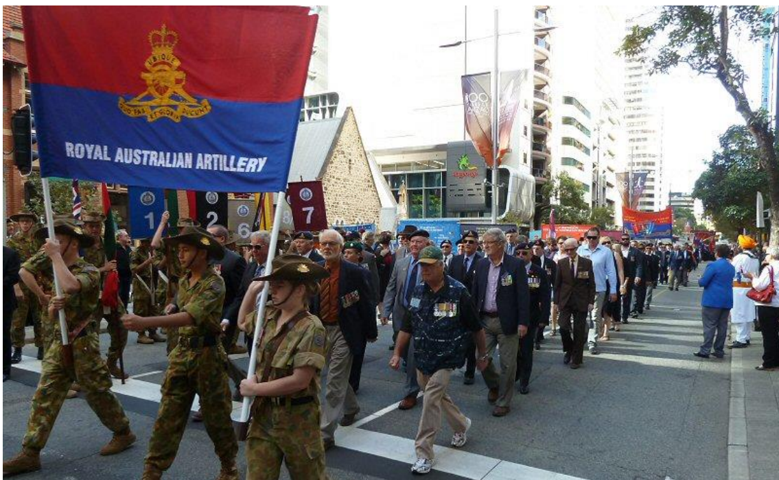
LEST WE FORGET 1915 - 2015