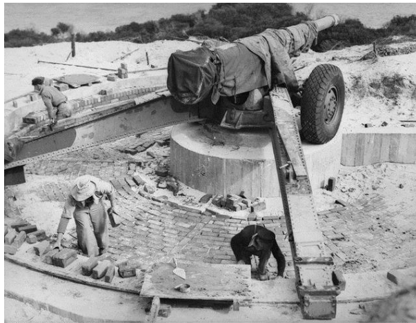
AUSTRALIAN WAR MEMORIAL 054025 155 mm M1917/M1918 gun - North west corner of Garden Island 1943 - AWM 054026

Separating Shoalwater Bay and Cockburn Sound, Cape Peron was an ideal location for a defensive Battery. Known as K Bty it was the Southern-most arm of Fortress Fremantle and comprised of two M1918 155mm French designed and American modified guns, mounted on Panama Mounts (A round concrete and brick configuration with a steel rail for the gun trails to swing on) These weapons covered the southern approaches to Garden Island and the channel between Cape Peron and Garden Island.