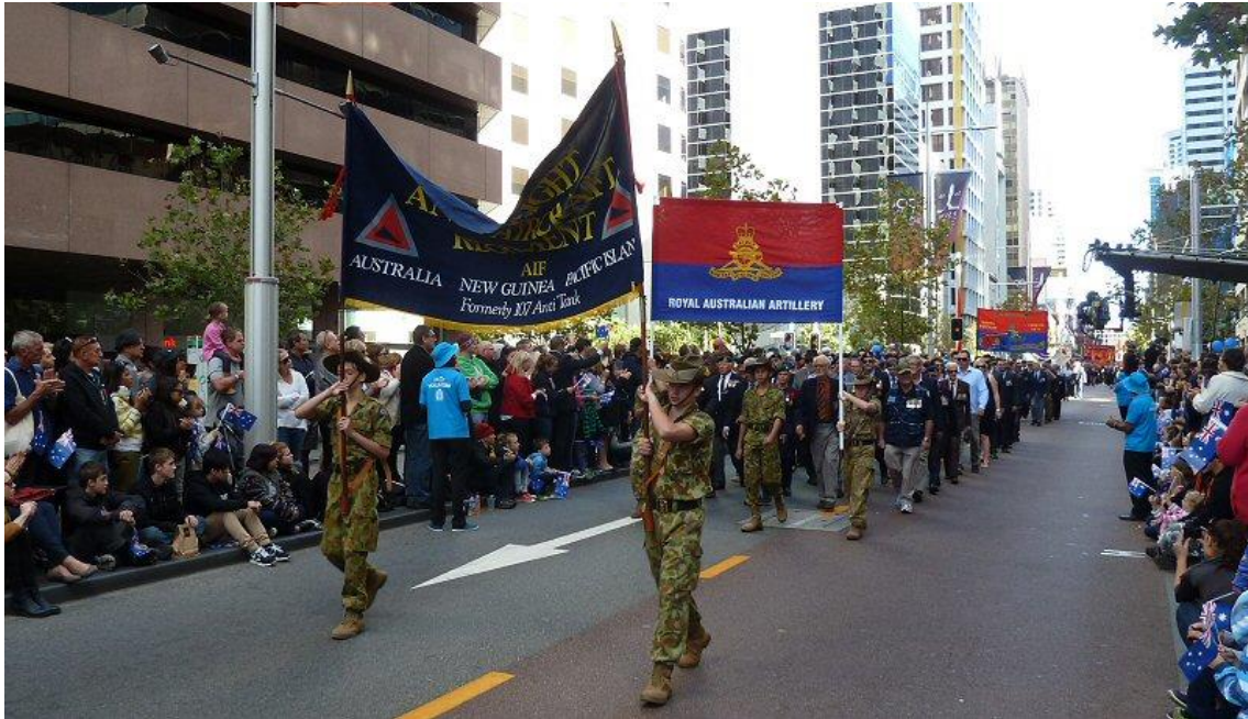
ANZAC DAY 2015