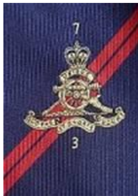
DETAILS ON TIE