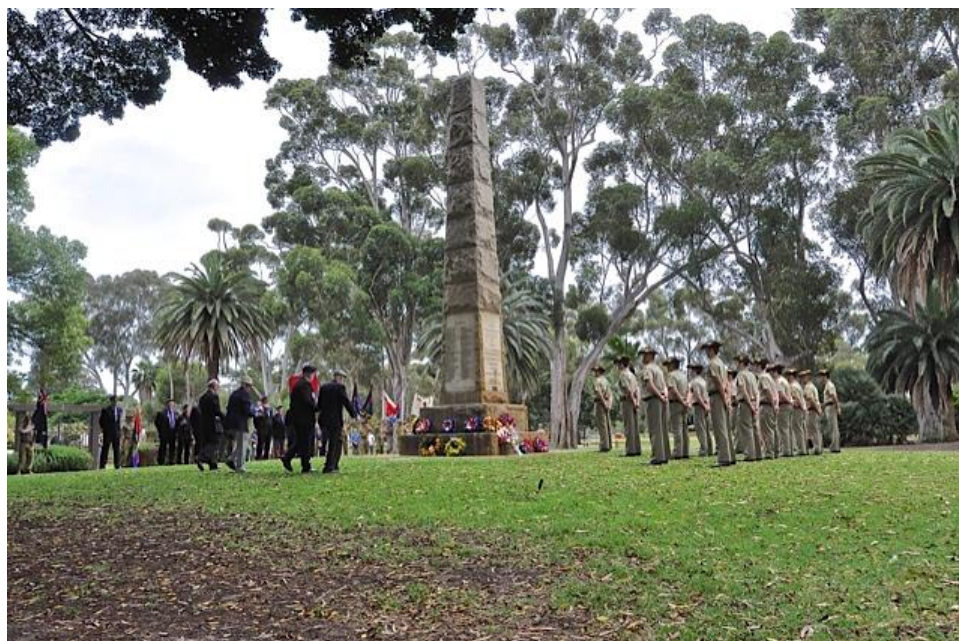
GUNNERS DAY 2015