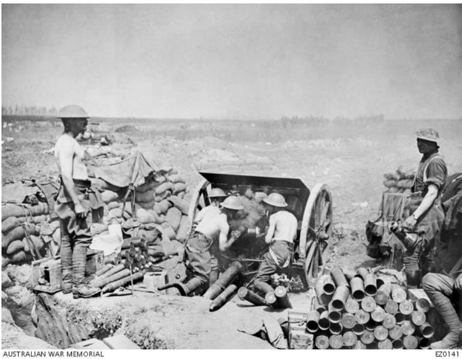
FIRE SUPPORT AT POZIÈRES - JULY 1916