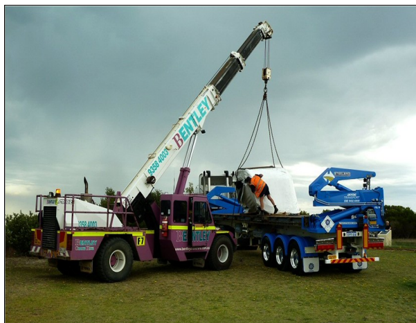
The shield arrives November 2014