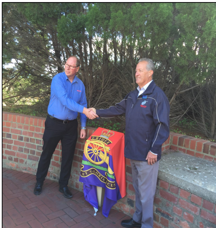
The Official Handing Over of the Shield