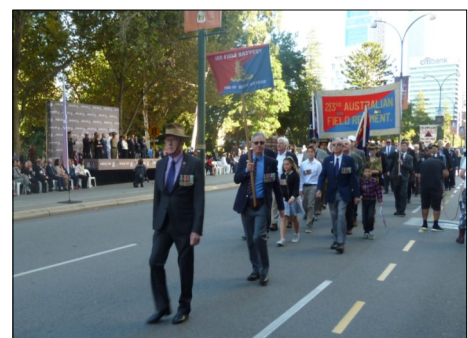
102 Field Battery