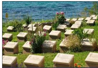
Gallipoli War Cemetery

The weather was a marked improvement on last year, and despite the heightened awareness of terrorist activities throughout much of Europe and the barricades lining the route designed to prevent unwanted vehicle access, the turnout was both a reflection of the sunny day and the manner in which this historic day is always recognised.