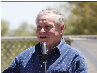
The Hon Colin Barnett address the Gathering

“I happened to bump into this guy 25 years ago and he