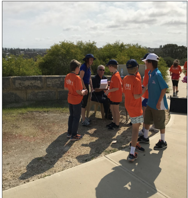
Where do I go?