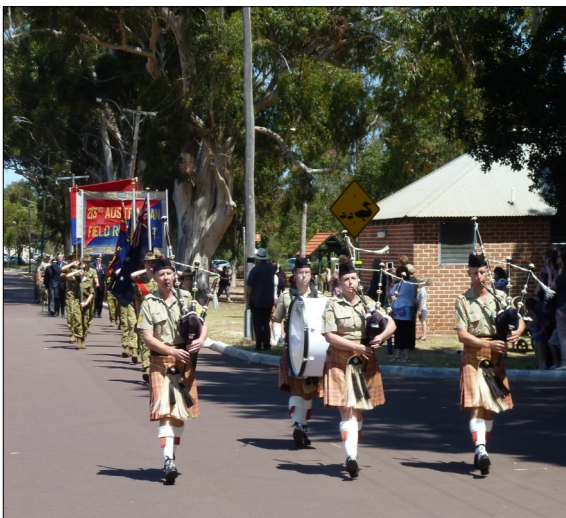
The Army Band lead the March