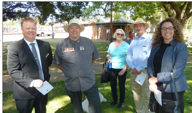
The Official Guests

The weather was warm and the Church Service was very moving. The luncheon afterward was a perfect opportunity to enjoy a subway roll or cookie and from there many moved to the eastern regional RSL or Rose and Crown for camaraderie.