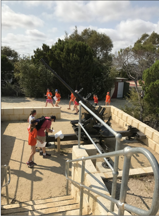
Looking for clues

Leighton Battery volunteer guides supported the activity that saw 95 children hunting answers to 10 questions about the historical aspects of the site. It was a fun activity that also allowed us to contribute to community within Mosman Park.