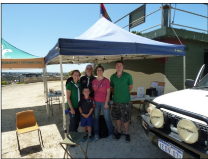
Haylie and crew

They had complete access to the site Friday evening to Sunday morning, then relocated to adjacent to the radar shack whilst tours were in operation Sunday. The RAAHS-WA were only too pleased to provide access to the site and be a part of this community event.