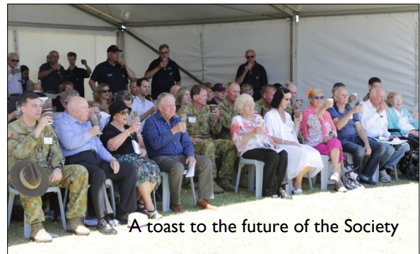
A toast to the future of the Society