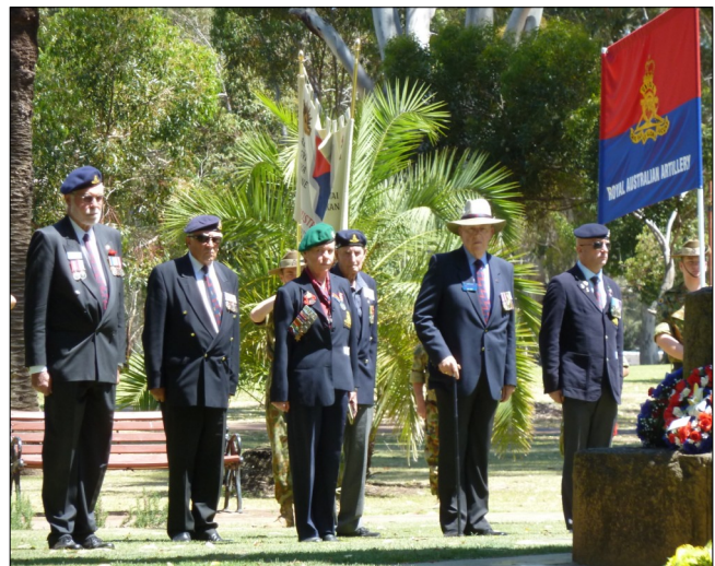
The Wreath Laying Complete