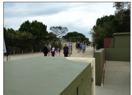
Move to the Stands