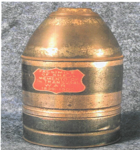
Boer War Christmas Tin.