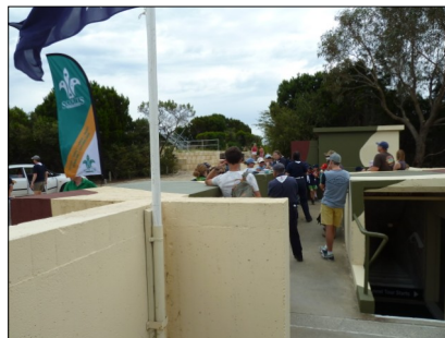
Preparing for the Brief