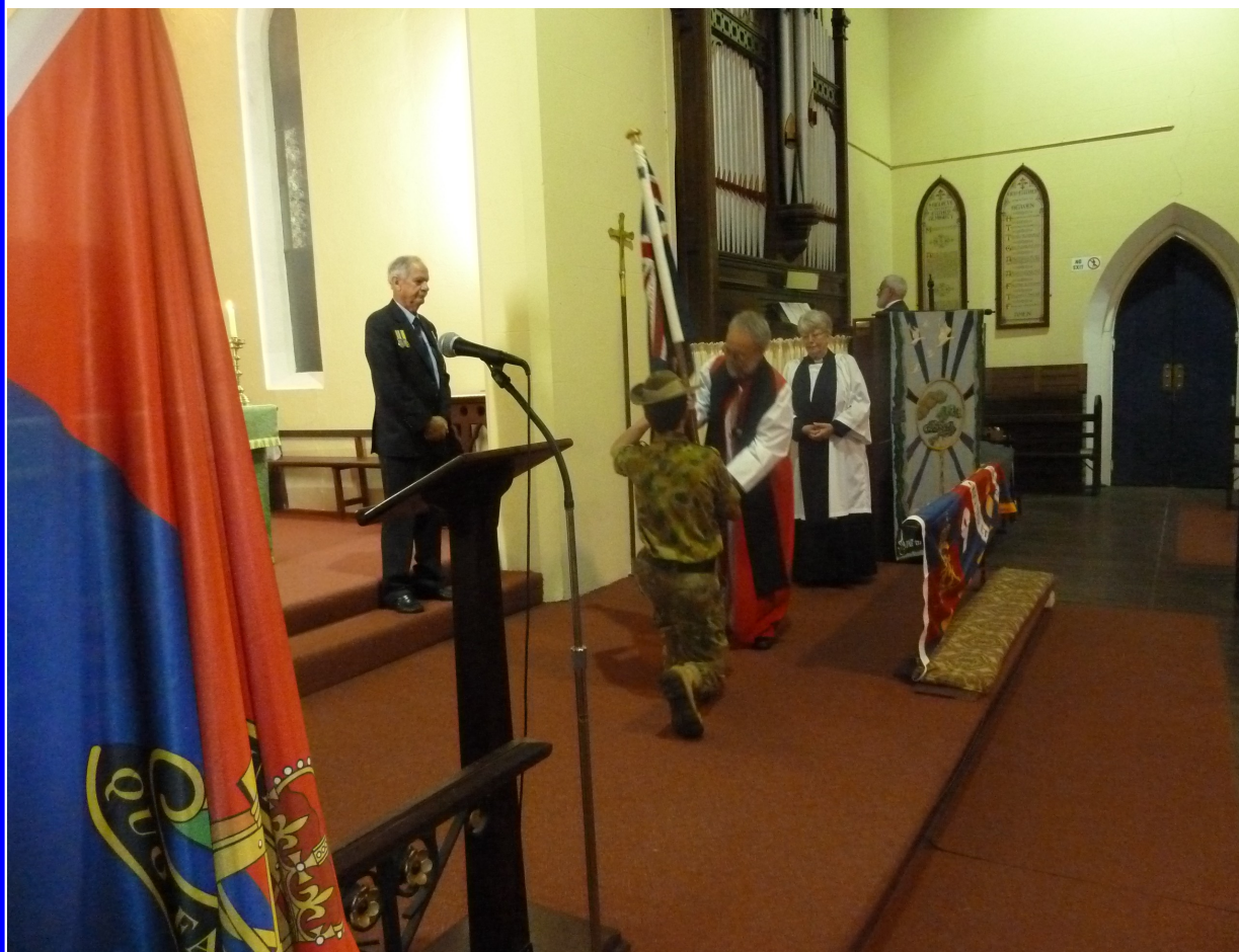
9 REGT STANDARD