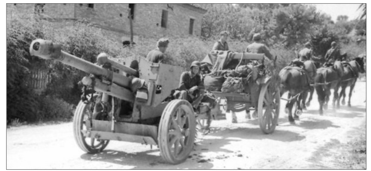
German 105, horses and Limber in Italy 1944

In terms of the killing power of the gun itself, the 25pdr gun shield and elevation mechanism was designed to allow very high angle fire,