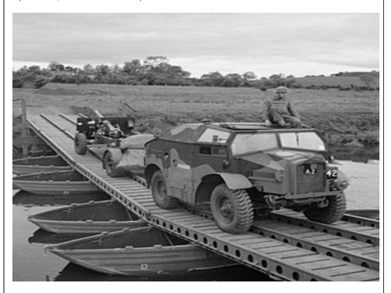
25pdr, limber and Quad advancing in Italy in 1944

The 25pdr was also designed from the off to be road and off road transportable and part of a mechanised army; part of the reason costs had to be cut was every gun was bought with its own 4wd transport vehicle (a Morris Quad for most of WW2).