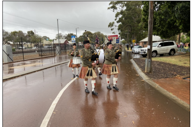
Marching in the Rain