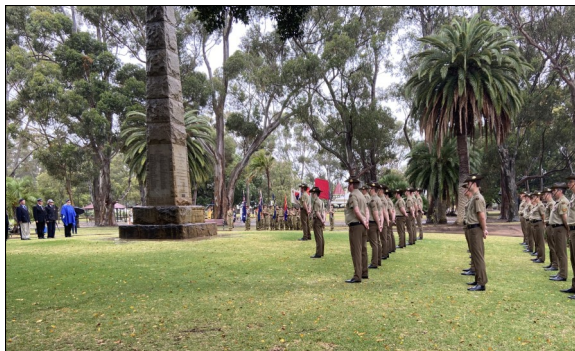
Take up Position