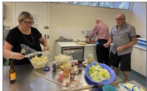
The Workers in the kitchen