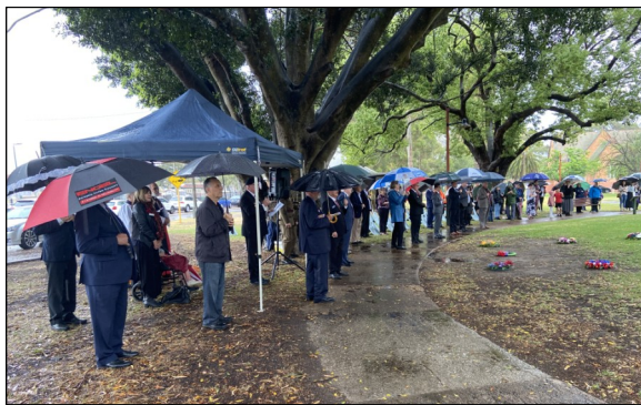
A sea of umbrellas