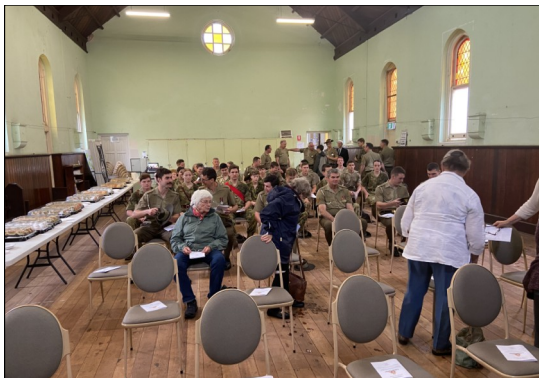
Overflow into the