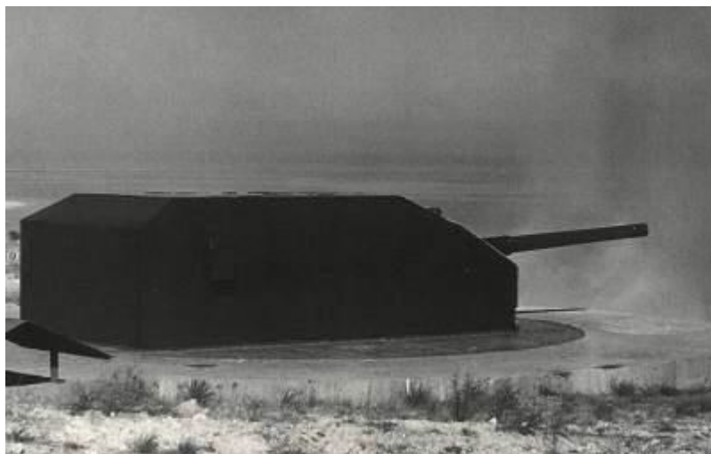
5.25 inch Coast I AA at Leighton Battery firing in the Coast Defence role.

The final installment of the article will appear in Edition 2/23